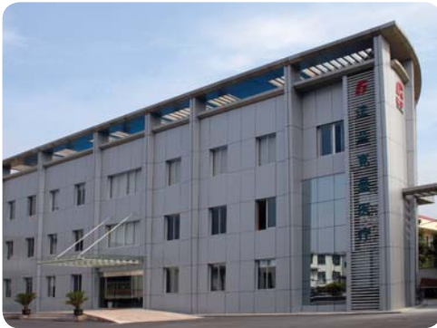
State-of-the-art manufacturing facilities.

That way we know we will be able to deliver the highest quality products to the medical profession both today and way into the future.