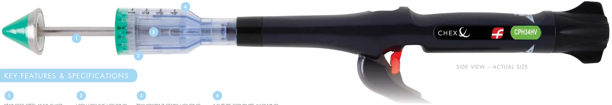
SIDE VIEW – ACTUAL SIZE

In surgical treatment of haemorrhoidal disease, and especially when combined with ODS, a key surgical objective is the correction of internal rectal prolapse. Until the introduction of the Chex™ CPH range from Frankenman International Ltd staplers used in the treatment of haemorrhoids had evolved from conventional surgical staplers, designed for conventional surgical anastomosis making their use in the treatment of associated haemorrhoidal prolapse less than ideal. The Chex™ CPH34HV is the first device specifically designed to maximise the volume of the staple housing whilst maintaining the essential design characteristics of, what has been proven scientifically and in clinical use, to be the most effective device in use today for Stapled haemorrhoidopexy. The Chex™ CPH34HV a remarkable step forward in the treatment of haemorrhoids, ODS and associated Rectal Prolapse.